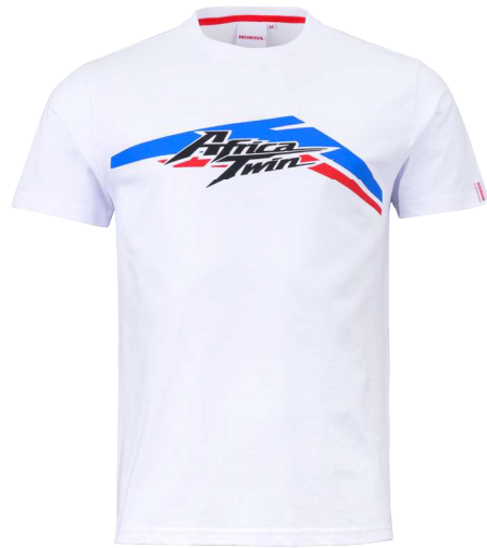
AFRICA TWIN WHITE 233-8820040-00