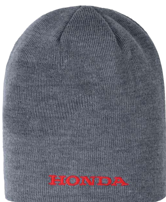
CORPO REVERSIBLE 243-0506042-03