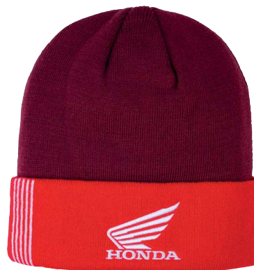
RED RACING 243-0506042-01