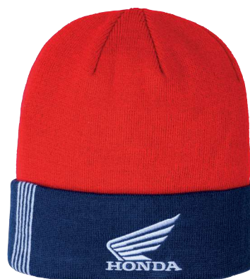
NAVY RED RACING 243-0506042-20