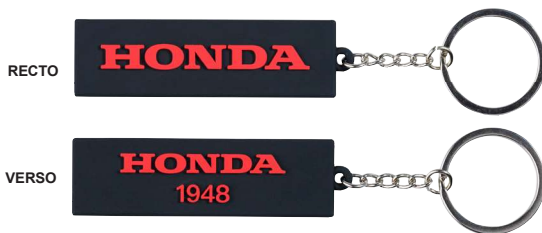
PADDOCK RUBBER 233-0601012-09