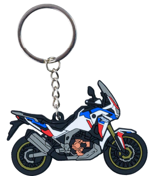
7cm AFRICA TWIN RUBBER 233-0601015