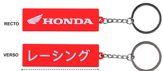
RACING RUBBER 233-0601012-01