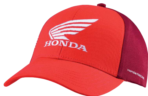
RACING RED 243-7020060-01