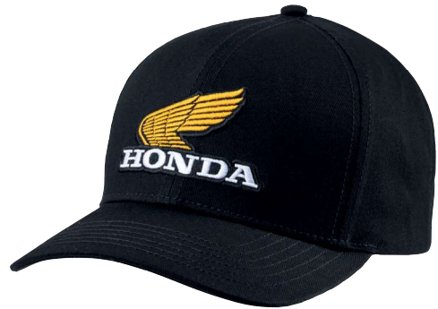
VINTAGE BLACK 243-7020060-11