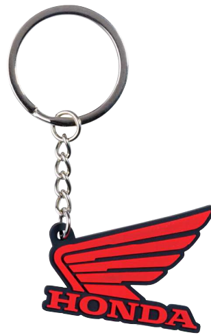
4cm WING RUBBER 233-0601013