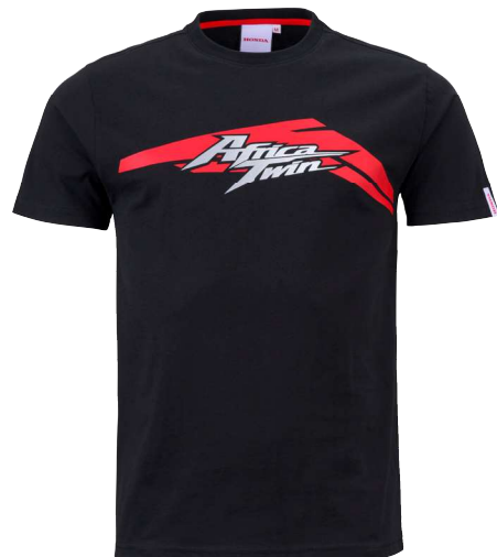
AFRICA TWIN BLACK 233-8820040-09