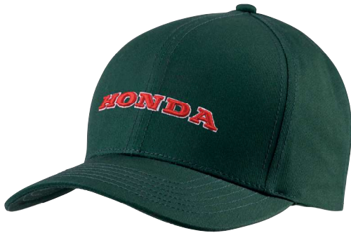
TOKYO GREEN 243-7020060-05