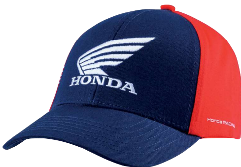
RACING NAVY 243-7020060-02