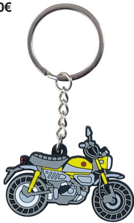
5cm MONKEY RUBBER 233-0601016