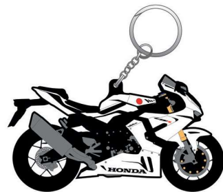
7cm CBR RUBBER 233-0601014