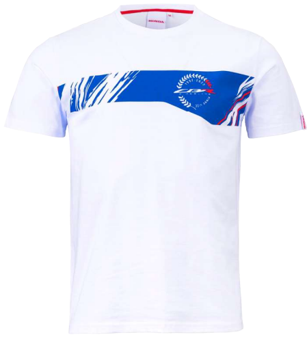
CBR 30 TH 233-8820040-30