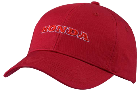
TOKYO RED 233-7020060-01