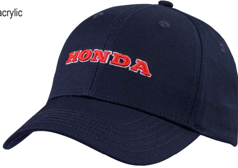
TOKYO DENIM 233-7020060-02